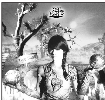
Bat for Lashes Two Suns (Astralwerks)